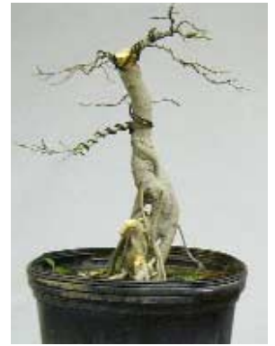
Pedro works on Ficus. The after photo on right is the finished product.