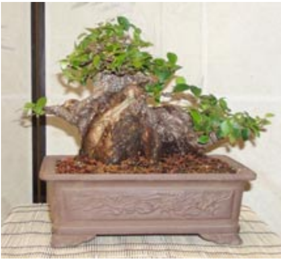
Top left: Roberto “rescued” this strangler fig and cut it down to shohin size. Suthin (top right) removes a large root and some branches and the final fig is pictured above.